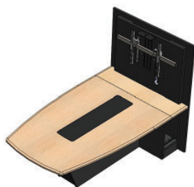
Code T526 Classic

526FR + 526RW (Choice of Single, Dual or XL Monitor Mount - Price Varies)